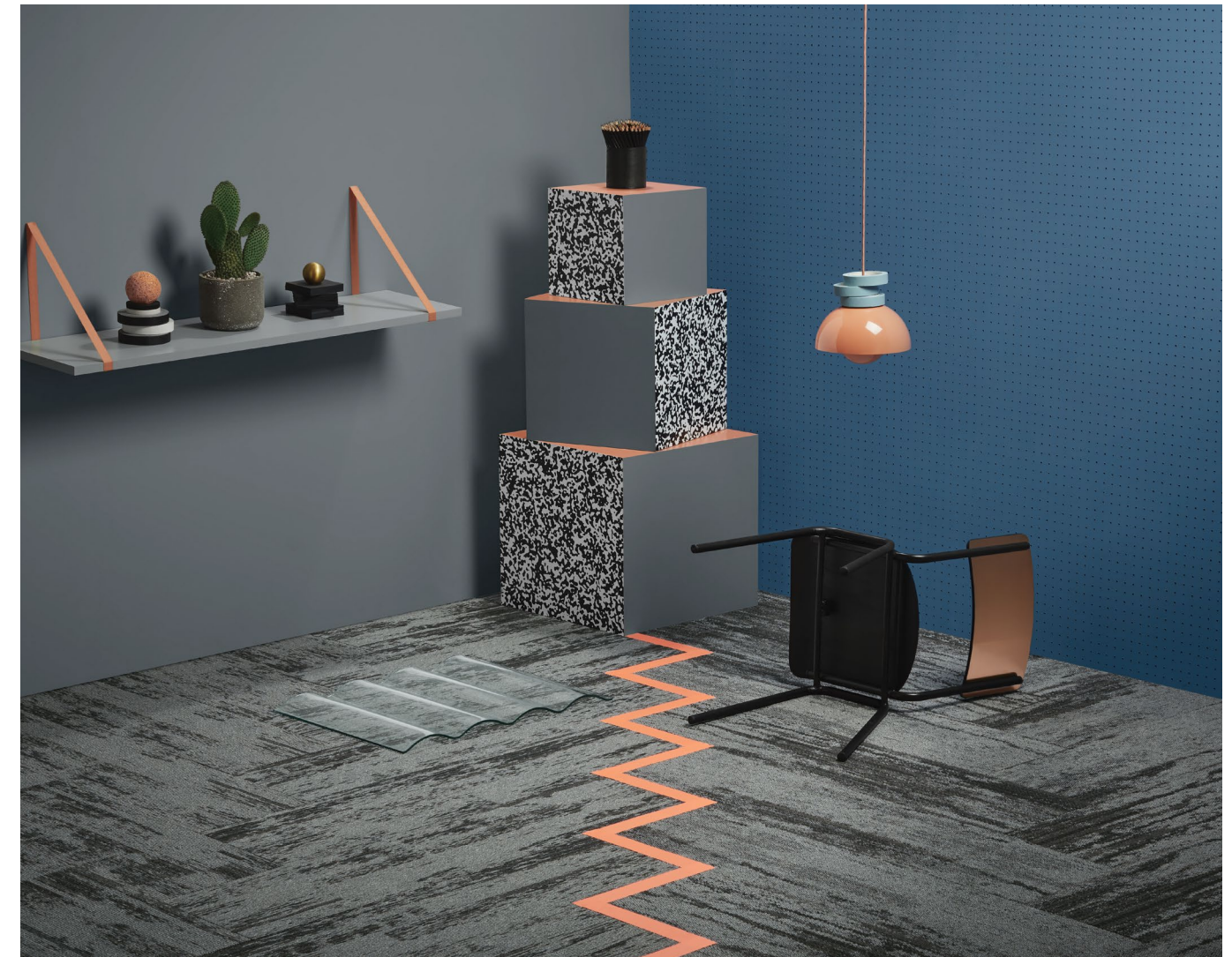
Hard Graft | Graded & Shaded | Hype