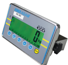
AE 402 Indicator