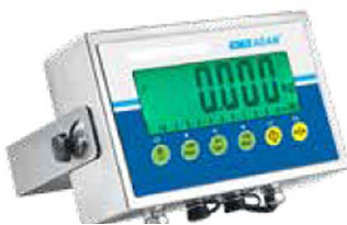
AE 403 Indicator