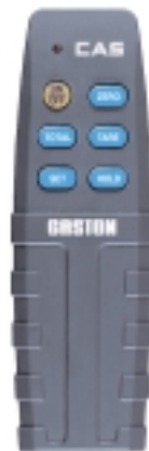
◀ Remote Control