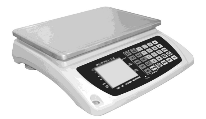
Figure 1 Scale body & pan