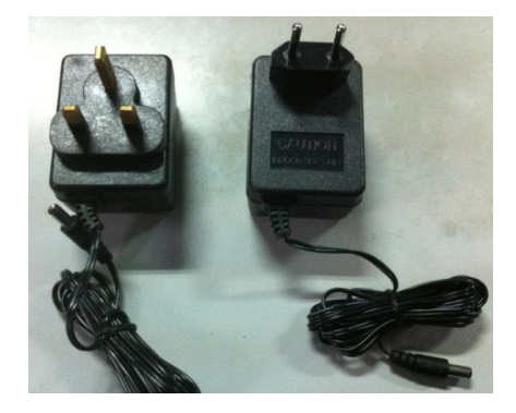
Figure 2 power adapter