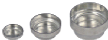
AX-ROUND-PAN Aluminum pans