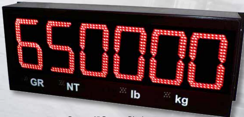
Beacon 65 Remote Display ▲