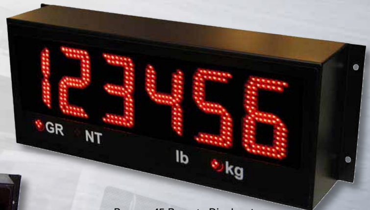
Beacon 45 Remote Display ▲