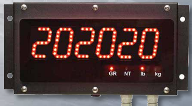
Beacon 20 Remote Display ▼