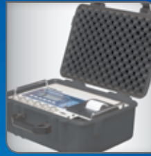
Pair with an RW-2601P Indicator