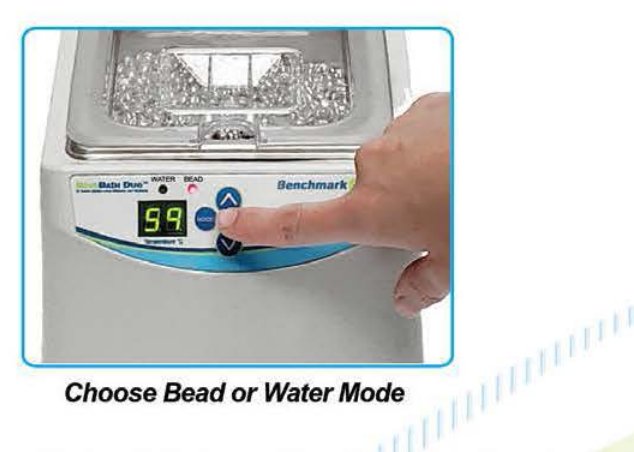
Choose Bead or Water Mode

Designed to be left on constantly (no wait for heat-up)