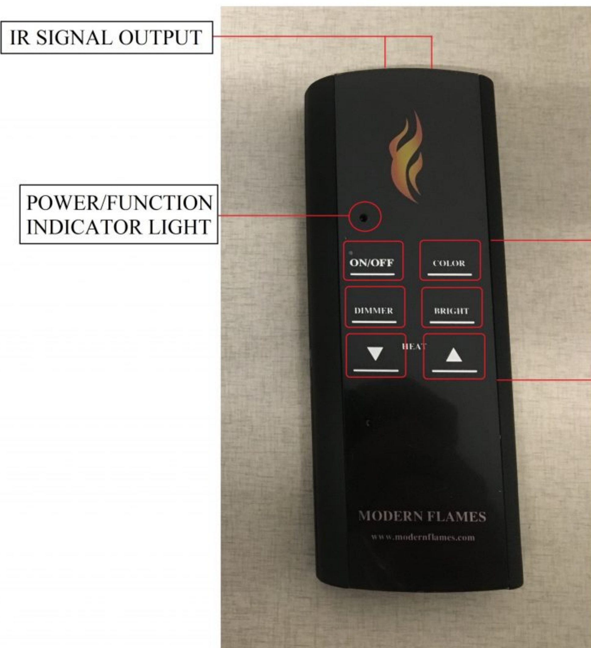
MFR2-6 CLX2, Lfv2

*NOTE* TAP OR BRIEFLY PRESS TO PERFORM A FUNCTION, STAND AT LEAST 2 FEET AWAY FROM UNIT TO ALLOW LINE OF SIGHT FOR I.R. SENSOR