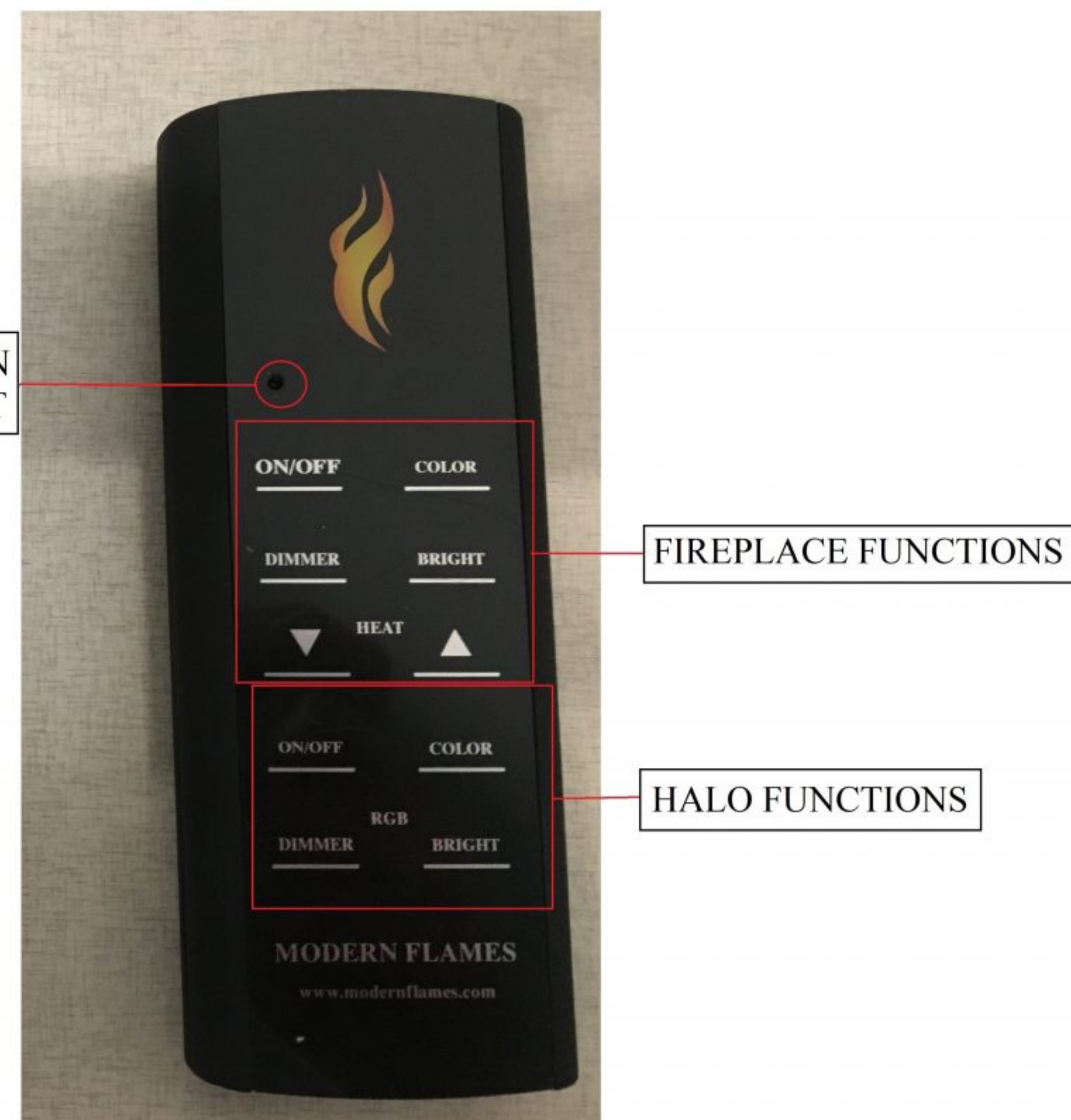
MFR2-10 CLX2 W/HALO

*NOTE* TAP OR BRIEFLY PRESS TO PERFORM A FUNCTION, STAND AT LEAST 2 FEET AWAY FROM UNIT TO ALLOW LINE OF SIGHT FOR I.R. SENSOR