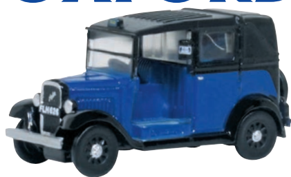
Austin Low Loader Taxi - Oxford Blue 120AT002 SCALE 1:120 PRICE £7.45