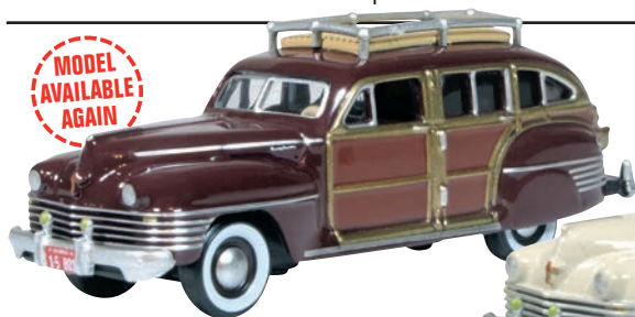
1942 Chrysler T & C Woody Wagon - Regal Maroon