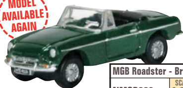
MGB Roadster - British Racing Green NMGB003 SCALE 1:148 PRICE £6.45