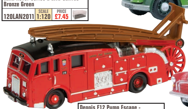
Dennis F12 Pump Escape - London Fire Brigade 120DEN001 SCALE 1:120 PRICE £8.95