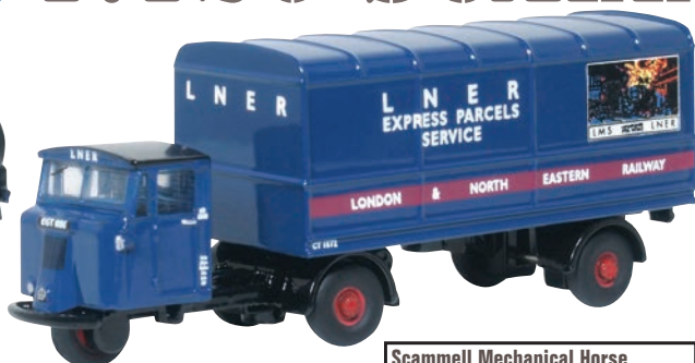
Scammell Mechanical Horse Van Trailer - LNER 120MH004 SCALE 1:120 PRICE £9.95