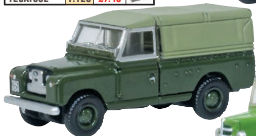
Land Rover Series 2 LWB Canvas - Bronze Green 120LAN2011 SCALE 1:120 PRICE £7.45