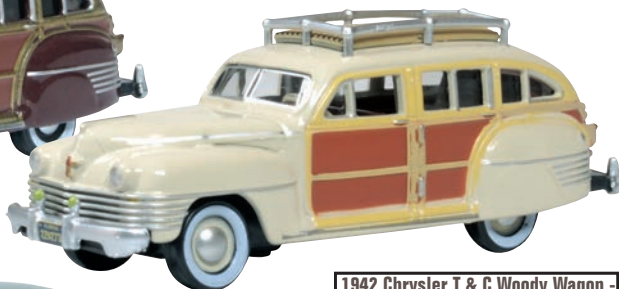
1942 Chrysler T & C Woody Wagon - Catalina Tan