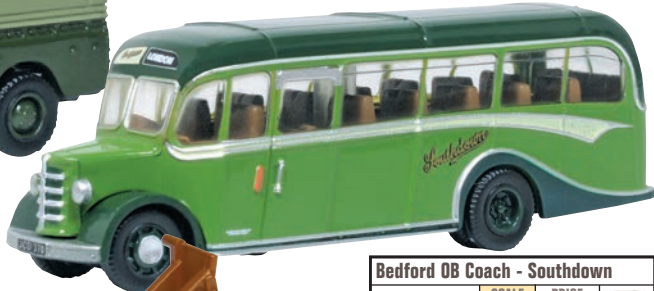
Bedford OB Coach - Southdown 1200B002 SCALE 1:120 PRICE £8.95