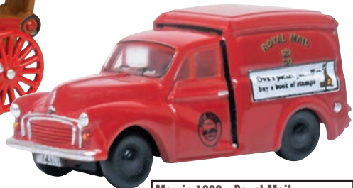
Morris 1000 - Royal Mail 120MM015 SCALE 1:120 PRICE £7.45