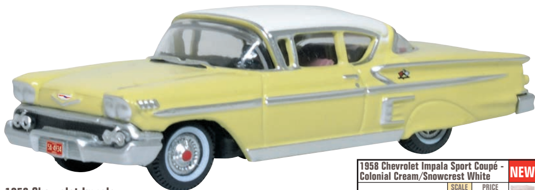
1958 Chevrolet Impala Sport Coupé - Colonial Cream/Snowcrest White

Oxford launched this newly tooled model in a metallic coral with contrasting snowcrest white masking to the roof. Our second release is painted with a delicate pale yellow body and once again adopts the snowcrest white masking to the roof resulting in a lovely springlike colour mix. The interior is a dusky rose colour. The impressive Chevy badge features on both the bonnet and the boot and our model is registered in Aloha Hawaii as 5A 4934. General Motors introduced the Impala in 1958. It was available as either a 2-door hard top or a convertible. It featured quad headlights at the front and the back sported three tail-lights which were flatter than the Bel Air, its immediate predecessor. Another refinement included a shortened roofline and wrap around rear