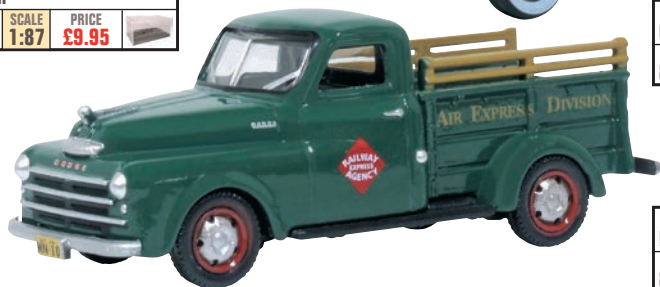
1948 Dodge B-1B Pickup - Railway Express Agency