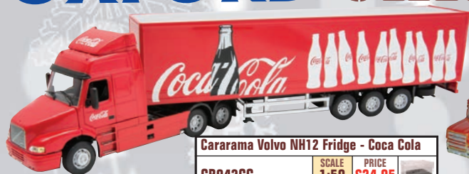
Cararama Volvo NH12 Fridge - Coca Cola