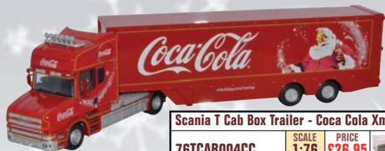
Scania T Cab Box Trailer - Coca Cola Xmas