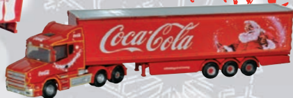
Scania T Cab Box Trailer - Coca Cola Xmas