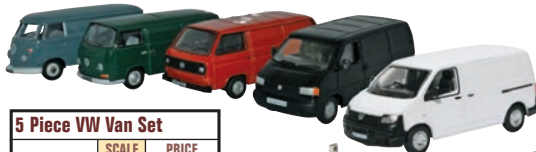
5 Piece VW Van Set