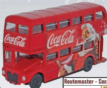
Routemaster - Coca Cola Xmas