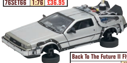
Back To The Future II Flying Version