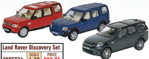
Land Rover Discovery Set