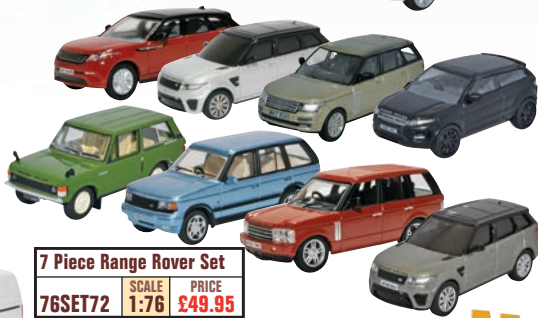
7 Piece Range Rover Set