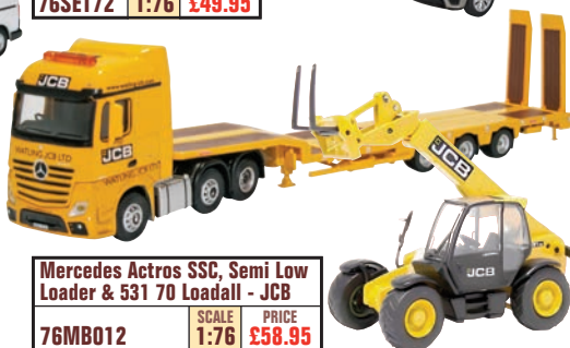
Mercedes Actros SSC, Semi Low Loader & 531 70 Loadall - JCB