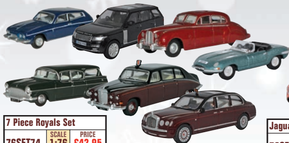
7 Piece Royals Set