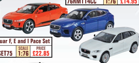
Jaguar F, E and I Pace Set