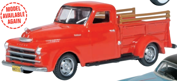
1948 Dodge 8-1B Pick Up Truck - Red 87DP48001 SCALE 1:87 PRICE £8.95