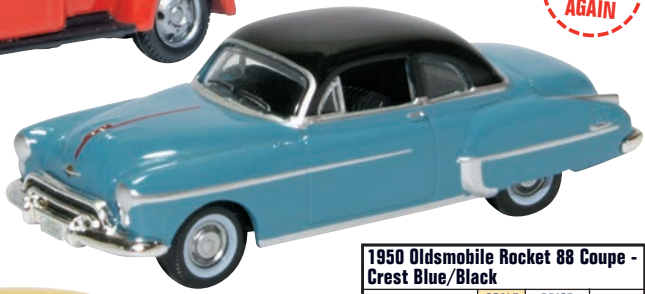
1950 Oldsmobile Rocket 88 Coupe - Crest Blue/Black 87OR50002 SCALE 1:87 PRICE £8.95