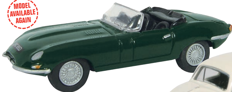
Jaguar E Type - Racing Green