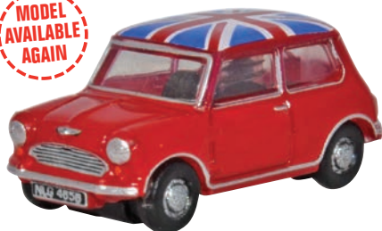
Austin Mini - Tartan Red/Union Jack