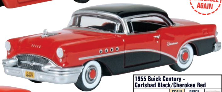
1955 Buick Century - Carlsbad Black/Cherokee Red 87BC55006 SCALE 1:87 PRICE £8.95