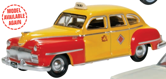
1946-48 DeSoto Suburban - San Francisco Taxi (Godfather) 87DS46002 SCALE 1:87 PRICE £8.95