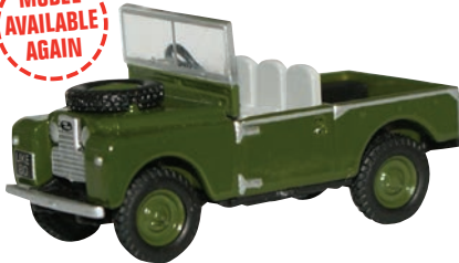
Land Rover - Bronze Green