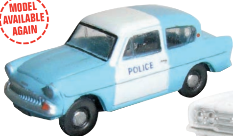
Police Panda Ford Anglia