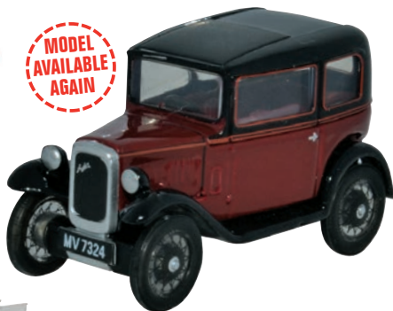
Austin Seven RN Saloon - Maroon