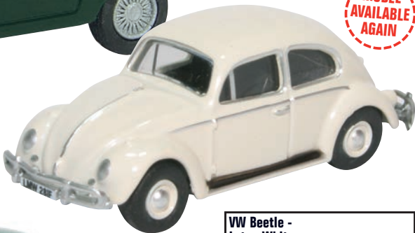
VW Beetle - Lotus White