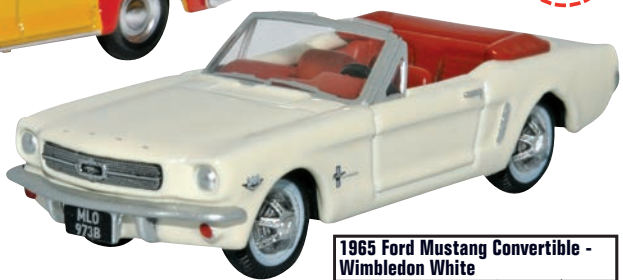
1965 Ford Mustang Convertible - Wimbledon White 87MU65005 SCALE 1:87 PRICE £8.95