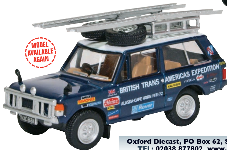
Range Rover Classic - Darien Gap