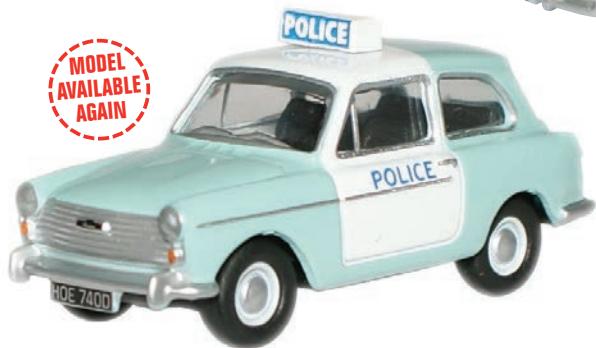
Austin A40 MkII - Police Panda