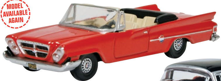
1961 Chrysler 300G Convertible (Open) - Mardi Gras Red 87CC61001 SCALE 1:87 PRICE £8.95