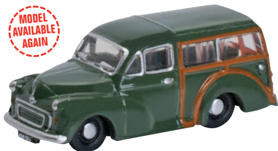
Morris Traveller - Almond Green (Dot Cotton)