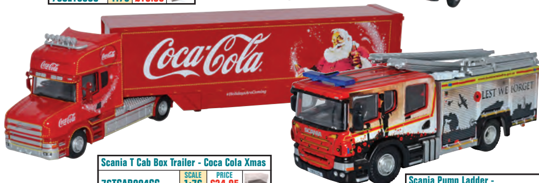
Scania T Cab Box Trailer - Coca Cola Xmas 76TCAB004CC SCALE 1:76 PRICE £24.95