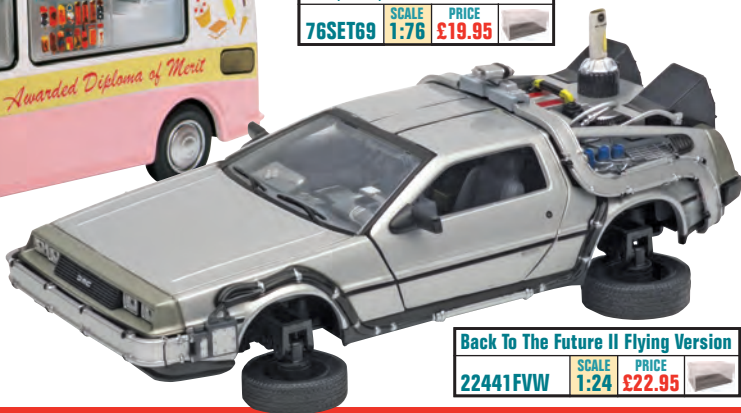
Back to The Future II Flying Version 22441FVW SCALE 1:24 PRICE £22.95