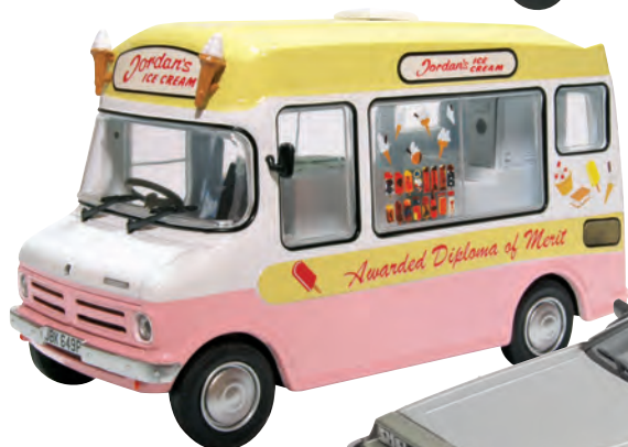
Bedford CF Ice Cream Van - Morrison Jordans 43CF004 SCALE 1:43 PRICE £17.95