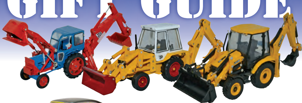
3 Piece JCB Anniversary Set 76SET76 SCALE 1:76 PRICE £69.95