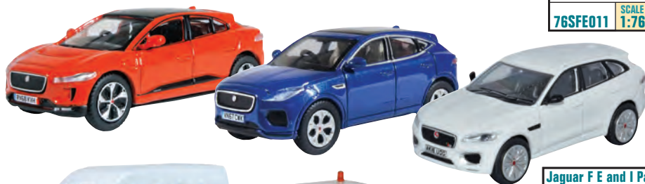
Jaguar F E and I Pace 3 Piece Set 76SET75 SCALE 1:76 PRICE £22.85