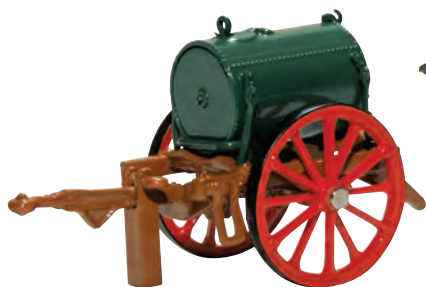
Water Bowser - Green