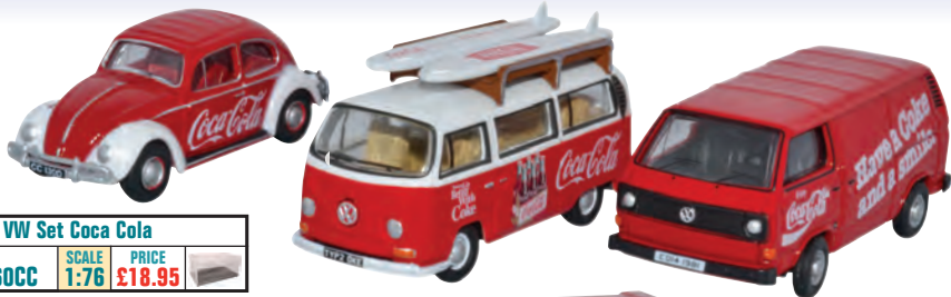
3 Piece VW Set Coca Cola 76SET60CC SCALE 1:76 PRICE £18.95

Featured here are some perfect gift ideas for this year to spoil your loved one, or even yourself! Over the months of November/December, all orders that are placed on the Oxford Diecast website, will have the chance to receive a special prize. There will be 5 Golden Tickets to find in your orders. Further details will be available on the website and the Facebook page in November.