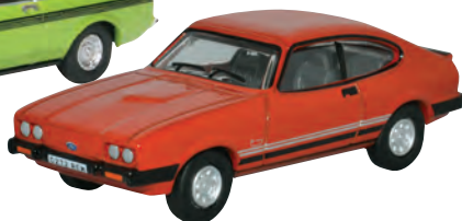
3 Piece Ford Capri Set Mk1/Mk2/Mk3 76SET69 SCALE 1:76 PRICE £19.95