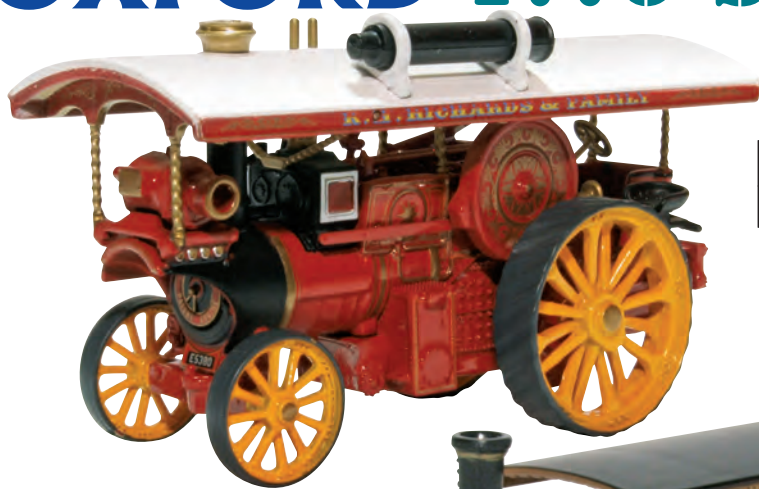
Burrell 8nhp DCC Showmans Locomotive No 2342 Vanguard