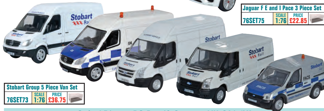
Stobart Group 5 Piece Van Set 76SET73 SCALE 1:76 PRICE £36.75