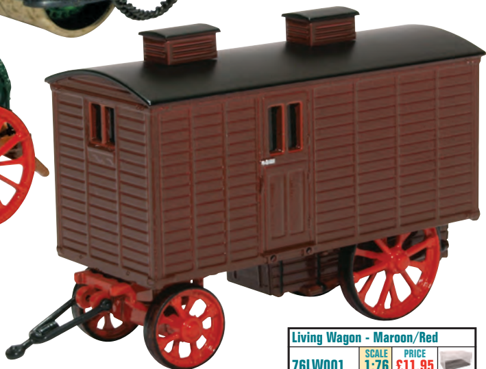
Living Wagon - Maroon/Red