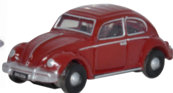
VW Beetle - Ruby Red NVWB002 SCALE 1:148 PRICE £3.75