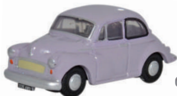
Morris Minor Saloon - Lilac NMOS001 SCALE 1:148 PRICE £3.75