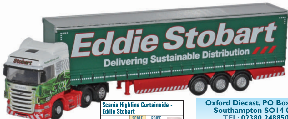
Scania Highline Curtainside - Eddie Stobart NSCA001 SCALE 1:148 PRICE £10.95

Oxford Diecast, PO Box 636, Southampton SO14 0TJ TEL: 02380 248850 www.oxforddiecast.co.uk