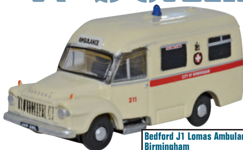
Bedford J1 Lomas Ambulance - Birmingham NBED002 SCALE 1:148 PRICE £4.75