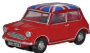
Mini - Tartan Red/Union Jack NMNO01 SCALE 1:148 PRICE £3.75