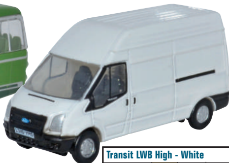
Transit LWB High - White NFT006 SCALE 1:148 PRICE £4.45