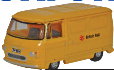
Commer PB Van - British Rail NPB002 SCALE 1:148 PRICE £4.25