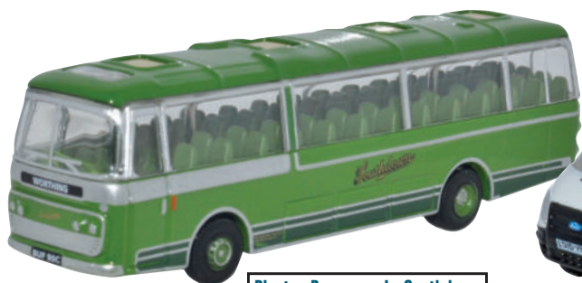
Plaxton Panorama 1 - Southdown NPP002 SCALE 1:148 PRICE £5.95