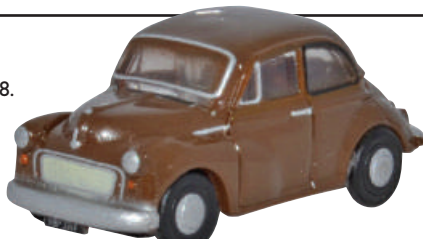
Morris Minor - Peat Brown

Only the second release off our new N scale tool, our finely detailed two-door saloon, registered VBP 374F, has a black chassis, off white front radiator grille and wheel surrounds with silver wheel inserts. The interior seating is red. The fine detail of this model extends to the black lining out round the rear windows and chrome Minor 1000 lettering.