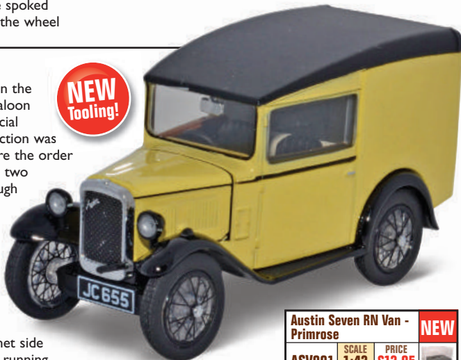
Austin Seven RN Van - Primrose