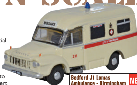
Bedford J1 Lomas Ambulance - Birmingham