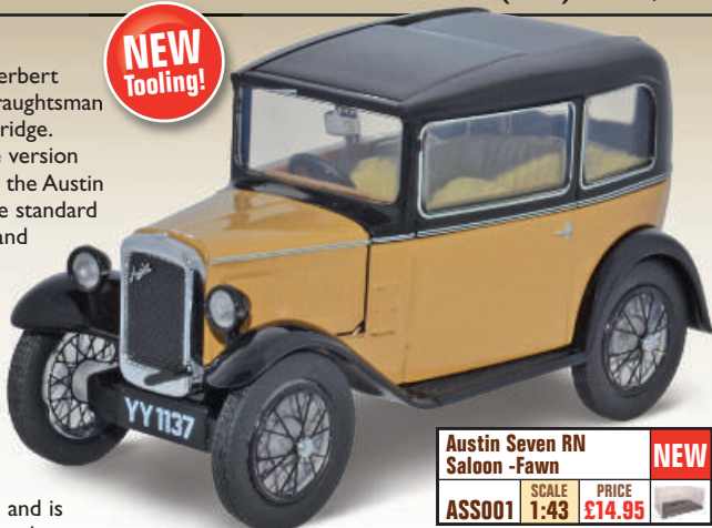
Austin Seven RN Saloon - Fawn