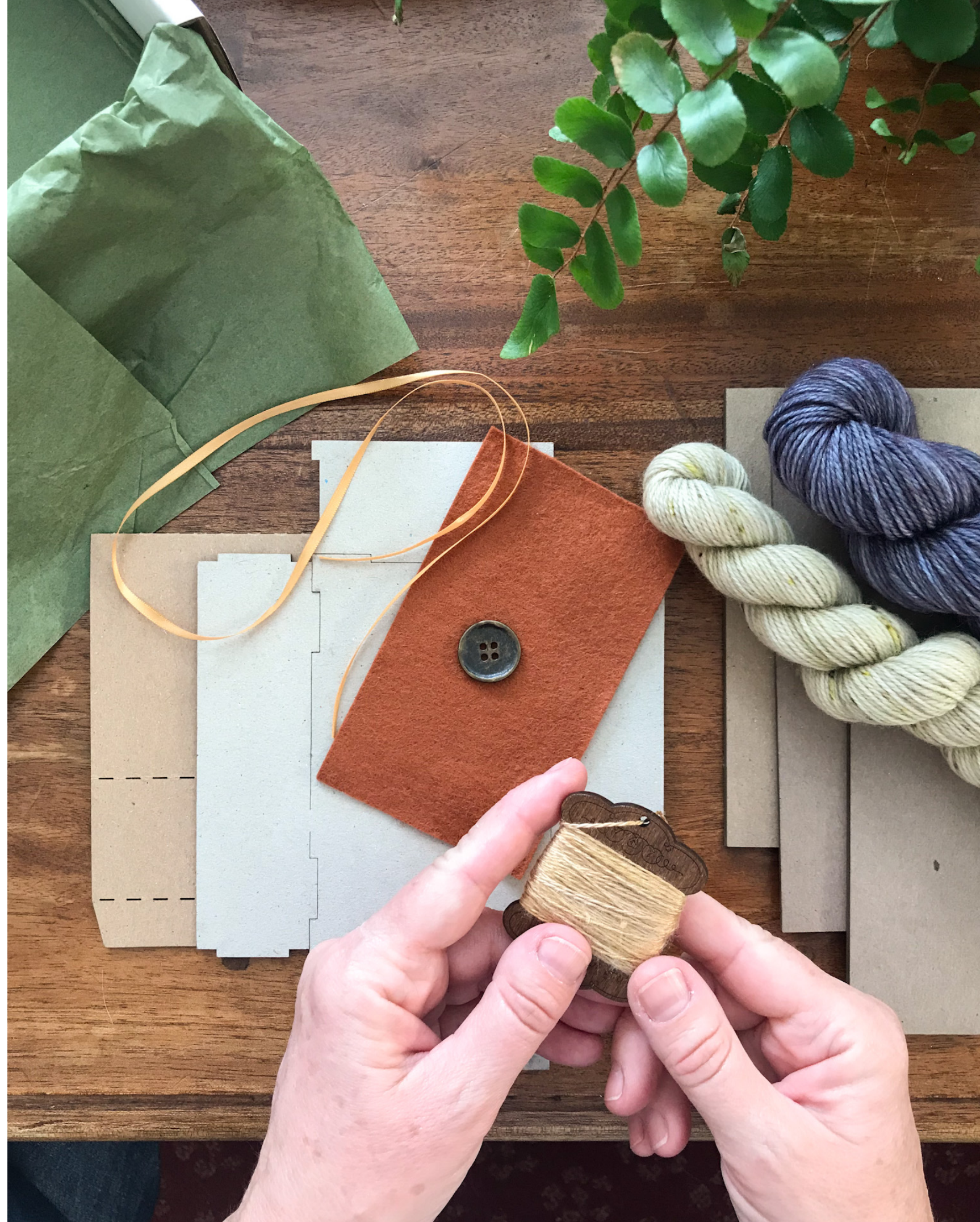
SLIDING BOX KIT