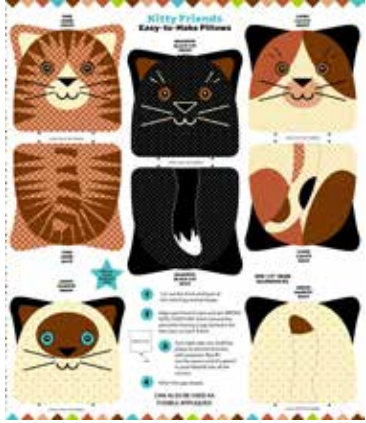
Kitty Friends 9967P-01

Every effort has been made to ensure that all projects are error free. All the information is presented in good faith, however no warranty can be given nor results guaranteed as we have no control over the execution of instructions. Therefore, we assume no responsibility for the use of this information or damages that may occur as a result. When errors are brought to our attention, we make every effort to correct and post a revision as soon as possible. Please make sure to check www.blankquilting.net for pattern updates prior to starting the project. We also recommend that you test the project prior to cutting for kits. Finally, all free projects are intended to remain free to you and are not for resale.