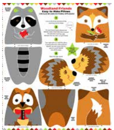
Woodland Friends 9965P-01