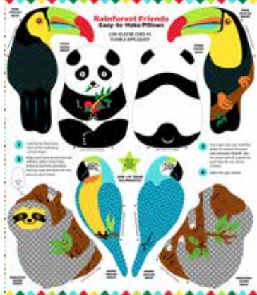
Rainforest Friends 9966P-01