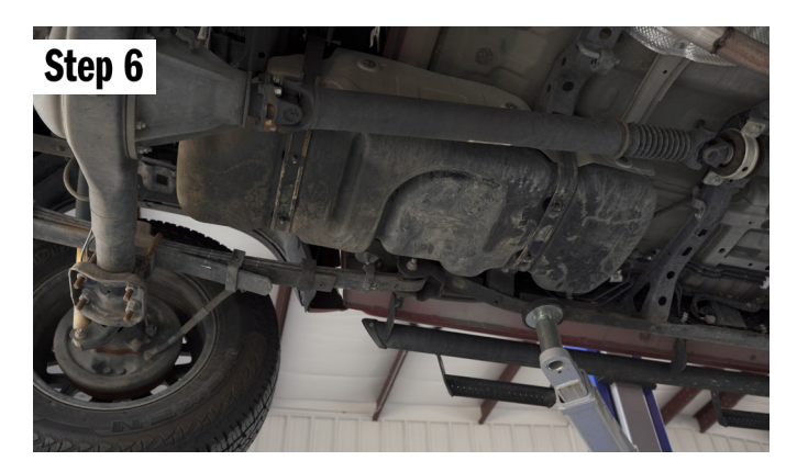
Take the strap off and replace with your new one, following these steps in reverse order.