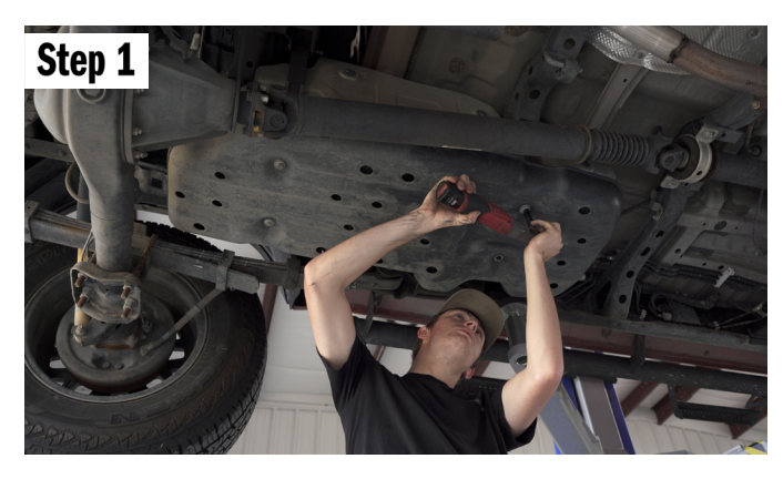
If you have a TRD Off-Road, remove the (4) nuts that hold on your factory gas tank skid with a 12mm socket. Remove the factory skid.