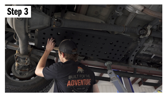
Re-install the (4) nuts.