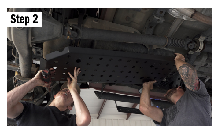
Using a floor jack or a friend, lift the skid plate into position and put the threaded studs though the (4) holes on the skid.