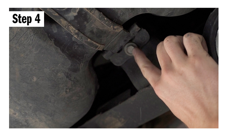
If you do NOT have TRD Tank Straps. Use a floor jack and put pressure on the gas tank to hold it in place. Remove the 12MM bolt holding the strap.