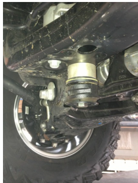
Close up of drivers side main spacer