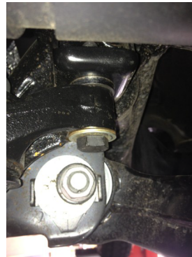
6mm spacer installed into diff mount under passenger side of vehicle