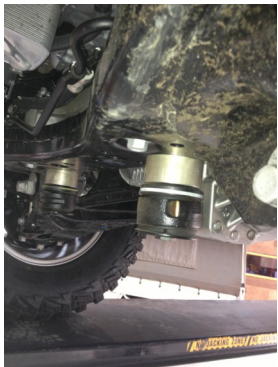
Shows Two Main Spacers installed from rear view

Suitable for Landcruiser 200 Series. Designed to allow for the front diff to be lowered by 25mm, thus reducing the angles CV Joints need to operate on.—Suitable for vehicles with KDSS and 2016 models.