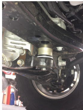
Close up of passenger side main spacer