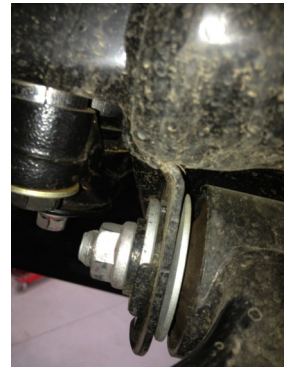
Shows small 6mm spacer installed into diff mount under passenger side of vehicle (side view)

Red dot indicates the larger main diff drop spacers and bash plate mount, inc new bolts.