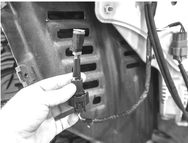
Factory Plug and Play Adaptor

Now re-attach the bumper in the reverse order you removed it in. Tighten all the bolts except the three on each side in the wheel well so that you can connect the wiring. The wiring will depend on many factors: adaptor, custom system, supplied harness, or professional install. In this instruction manual, we used the plug and play adaptor that utilizes the factory harness. Connect the pod to the factory harness using the adaptor. (Sold separately) Reconnect your battery terminal and you're finished!