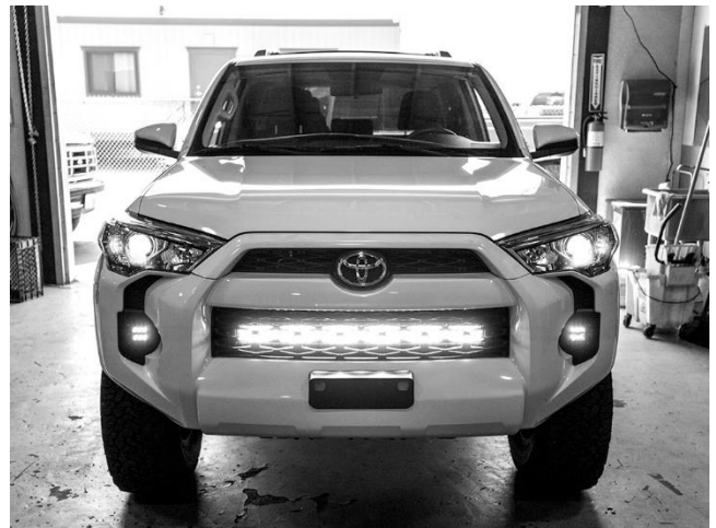
Finished install with Hidden 30" Bumper Bracket