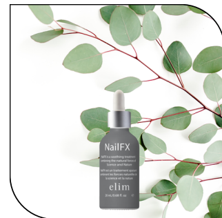
NAILFX $28 SINGLE $160 6-PACK MSRP $56

An antibacterial cuticle rescue with a blend of 10 oils to keep cuticles healthy. Available in 10 ml pipette dispenser format