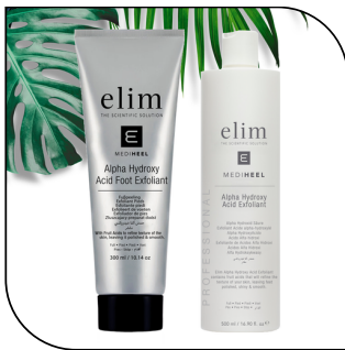
AHA EXFOLIANT $50/$70

pH balance the skin after callus peel Available in 200 ml and 500 ml format (100 and 250 applications)