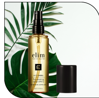
GOLD SPRITZ $48

An antibacterial cuticle rescue with a blend of 10 oils to keep cuticles healthy. Available in 20 ml pipette dispenser format (40 applications)