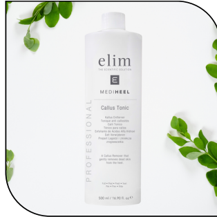
CALLUS TONIC $43/$62/$112

Formulated to effectively clean skin Available in 250 ml spray bottle