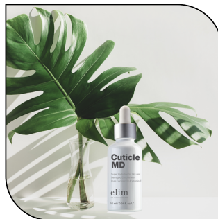
CUTICLE MD $15 SINGLE $86 6-PACK MSRP $30

The perfect finish to a pedicure, Gold Spritz contains a burst of shimmer to give your feet and legs a glamorous look and feel. Available in 100 ml