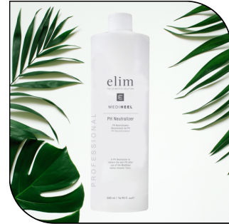
PH NEUTRALIZER $22/$42

Softens the protein bonds, making it easy to remove dry and callused skin from feet Available in 200 ml, 500 ml and 1000 ml formats (25, 62 and 125 applications)