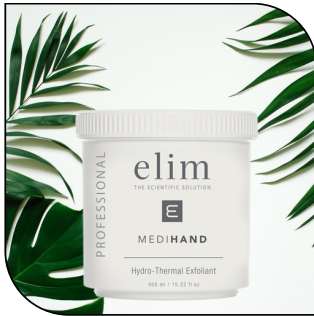
HYDRO THERMAL EXFOLIANT $98

A pH-balancing daily exfoliator with heating actives to enhance absorption of anti-aging ingredients. Available in 450 ml tub (90 applications)