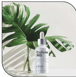
CUTICLE MD $22

A hydrating treatment that restores moisture and fights the signs of aging. Available in 450 ml format (180 applications)