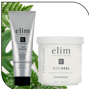
FOOT PERFECTOR $48/$66

A detoxifying clay mask enriched with botanicals. Available in 300 ml tube (60 applications)