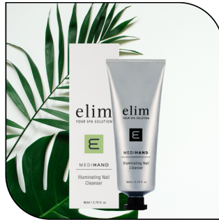
ILLUMINATING CLEANSER $20.50 SINGLE $117 6-PACK MSRP $41

A pH-balancing daily exfoliator with heating actives to enhance absorption of anti-aging ingredients. Available in 100 ml tube