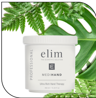
ULTRA RICH HAND THERAPY $66

A detoxifying clay mask enriched with botanicals. Available in 300 ml tube (60 applications)