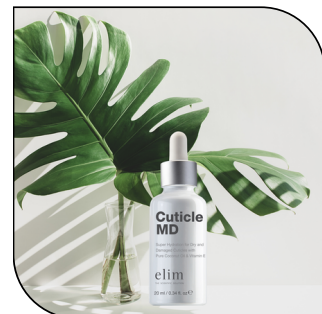
CUTICLE MD $22

The perfect finish to a pedicure, Gold Spritz contains a burst of shimmer to give your feet and legs a glamorous look and feel. Available in 260 ml (750 applications)