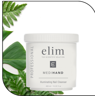
ILLUMINATING CLEANSER $59

A pH-balancing daily exfoliator with heating actives to enhance absorption of anti-aging ingredients. Available in 450 ml tub (90 applications)