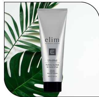
ULTRA MUD $71

An antimicrobial foot soak that cleanses the feet and nails. Available in 450 ml tubs (150 applications)