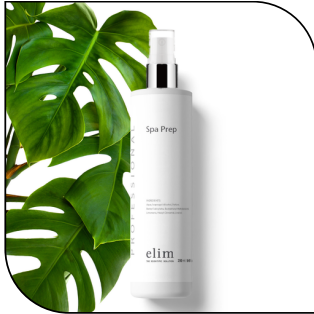
SPA PREP $18

Formulated to effectively clean skin Available in 250 ml spray bottle