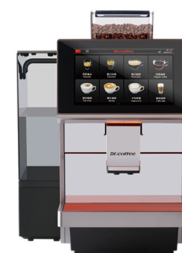
M12 Big Plus