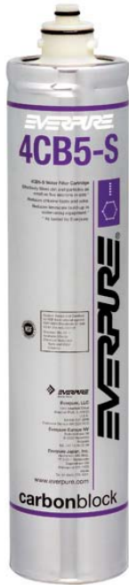
4CB5-S Replacement Cartridge: EV9617-21

Delivers quality water for foodservice, vending and OCS applications