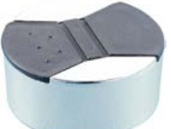
Transparent Dual Flap Many colors available