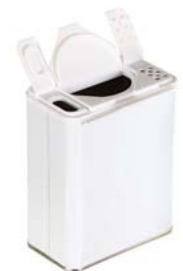
Spice Tins assorted sizes