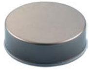
Aluminum With plastic insert