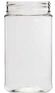
12 oz Round