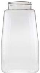
32 oz PET Tapered