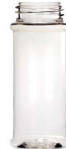
5.5 oz Round