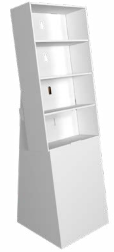
Corrugate Folding Shipper