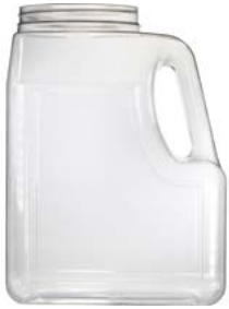
172 oz PET Handled

Here is just a sample of the many bottles we offer that are suited for foodservice packaging.