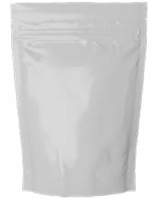
Pouches Printable standup & lay flat