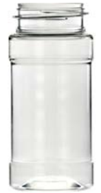
4 oz Round