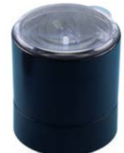
Black Textured With transparent cap