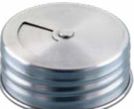
Stainless Multi aperture