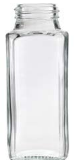
8 oz Square