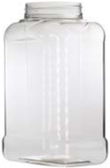
35 oz PET Rectangle