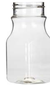
4 oz Square