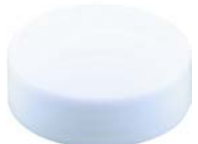
Plastic Smooth Many colors available