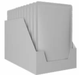
Seasoning Packets with display box