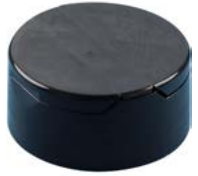
Plastic Dual Flap Many colors available

Here is just a sample of the many lids we offer.