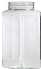
21 oz PET Gripped