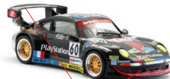
RS0007B White Kit