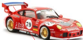
RS0007A White Kit