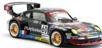
Porsche 911 GT2