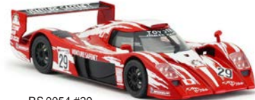
RS 0054 #29 24h Le Mans 1998