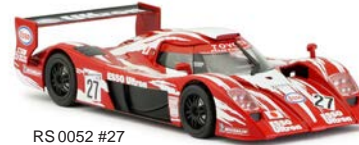
RS 0052 #27 24h Le Mans 1998

www.revoslotcars.com revoslot@revoslotcars.com