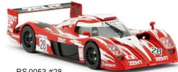
RS 0053 #28 24h Le Mans 1998

www.revoslotcars.com revoslot@revoslotcars.com