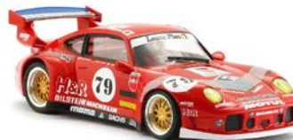
RS0031 Porsche 911 GT2 #79 24 H Le Mans 1998 Team ETS CHEREAU (F)