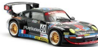
Porsche 911 GT2