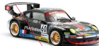
RS0007B White Kit