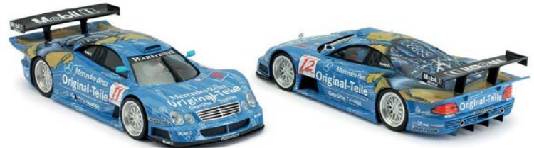
RS0113 CLK GTR twin pack FIA GT Championship 1998