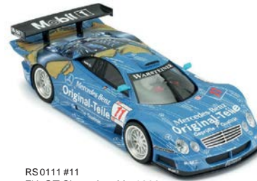
RS0111 #11 FIA GT Championship 1998 GT1 Class

www.revoslotcars.com revoslot@revoslotcars.com