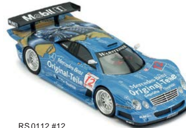
RS0112 #12 FIA GT Championship 1998 GT1 Class