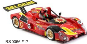
RS 0056 #17 24h Le Mans 1996 Body type C - Chassis Type A