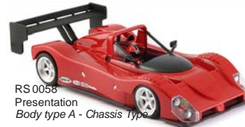
RS 0058 Presentation Body type A - Chassis type A