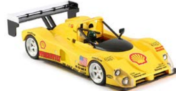
RS 0057 Challenge World Finals - Daytona 2016 Body type C - Chassis Type A