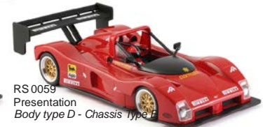
RS 0059 Presentation Body type D - Chassis type A