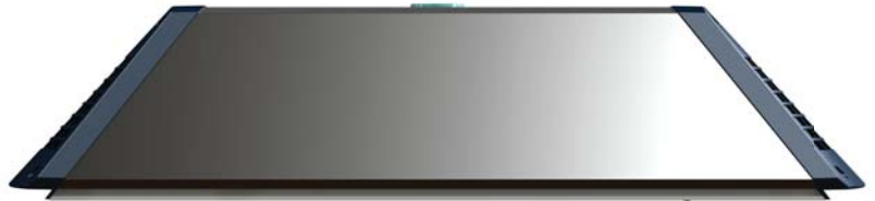
AC-30 Side View Shown