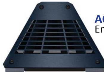
AC-30 End View Shown