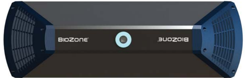
AC-30 Top View Shown