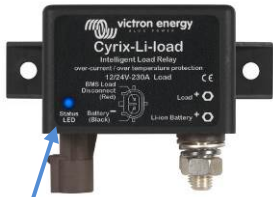
LED status indicator