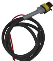
Control cable for Cyrix-ct 12/24-230 Length: 1 m