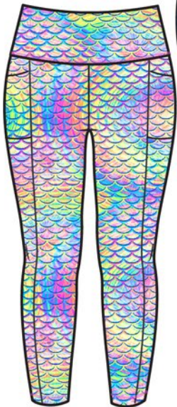
Psychedelic Mermaid SFA003PS