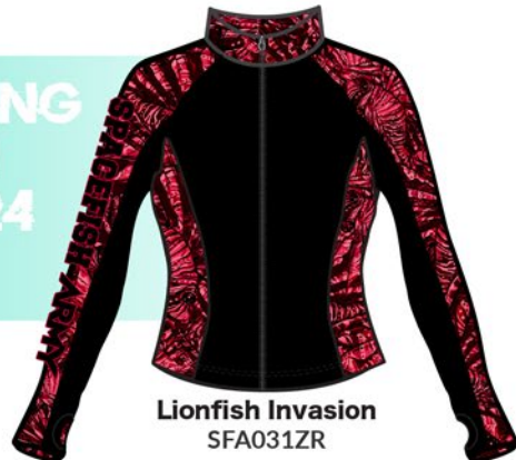
Lionfish Invasion SFA031ZR