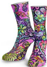
Octofloral Splatterparty SFA001DS

Sublimation Printing Full Sublimated One-of-a-kind Artwork that won't fade or crack