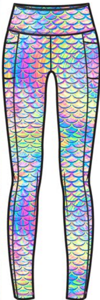
Psychedelic Mermaid SFA003YP

Sublimation Printing Full Sublimated One-of-a-kind Artwork that won't fade or crack