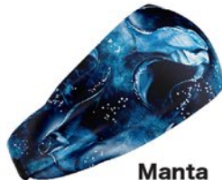
Manta Mayhem SFA005HB