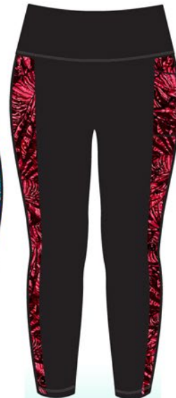
Lionfish Invasion SFA031PS