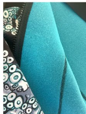
Electric Blue Octofloral SFA014SJ