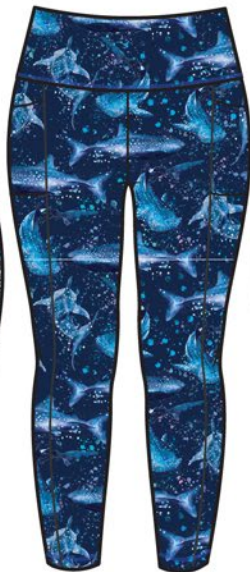
Whale Shark Wonderland SFA016PS