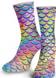
Psychedelic Mermaid SFA003DS