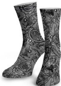
Deep Sea SFA018DS