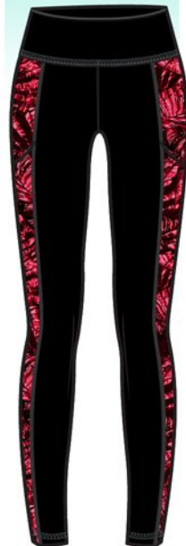
Lionfish Invasion SFA031YP