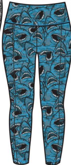
Shark Camo SFA022PS