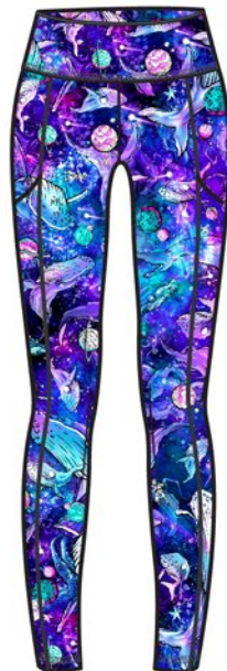
Cosmic Whale SFA028YP