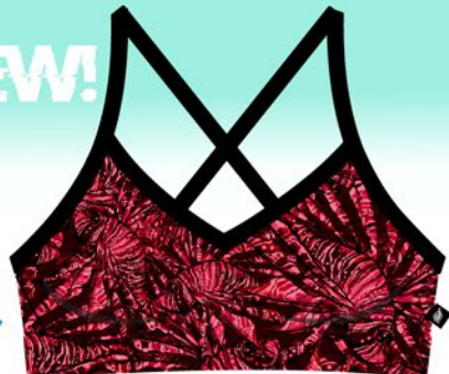
Lionfish Invasion SKU# SFA031BT