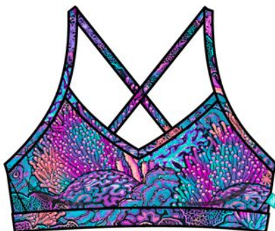
Coral Kaleidoscope SKU# SFA024BT