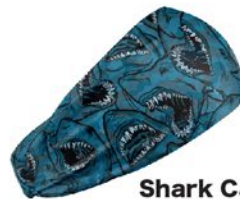
Shark Camo SFA022HB