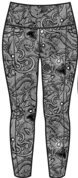
Deep Sea SFA018PS

Sublimation Printing Full Sublimated One-of-a-kind Artwork that won't fade or crack