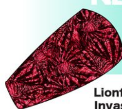
Lionfish Invasion SFA031HB