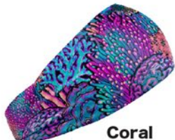
Coral Kaleidoscope SFA024HB