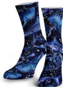
Whale Shark Wonderland SFA016DS