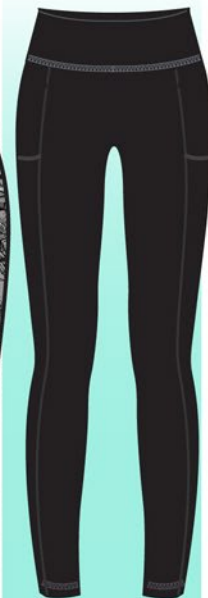
Night Dive SFA034YP