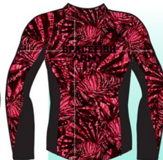
Lionfish Invasion Rashguard SFA031RG