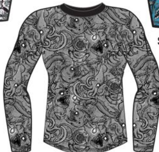
Deep Sea Rashguard SFA018MR