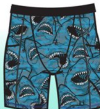
Shark Camo Scuba Shorts SFA022MS