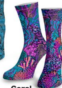
Coral Kaleidoscope SFA024DS