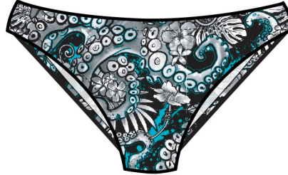
Electric Blue Octofloral