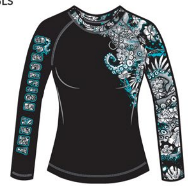
Electric Blue Octofloral SFA014LS