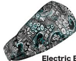
Electric Blue Octofloral SFA014HB