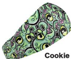
Cookie Octopus SFA027HB