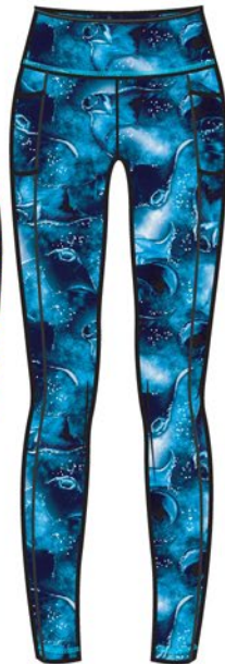
Manta Mayhem SFA005YP