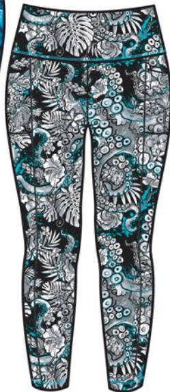
Electric Blue Octofloral SFA014PS