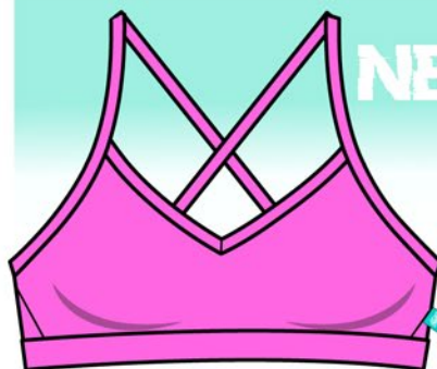
Sunset Pink SKU# SFA029BT