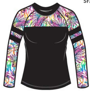
Lionfish Roar SFA019LS