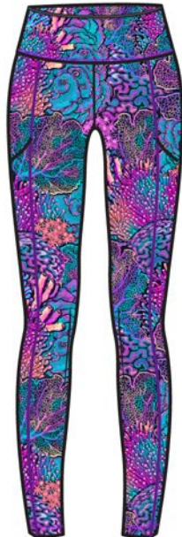
Coral Kaleidoscope SFA024YP