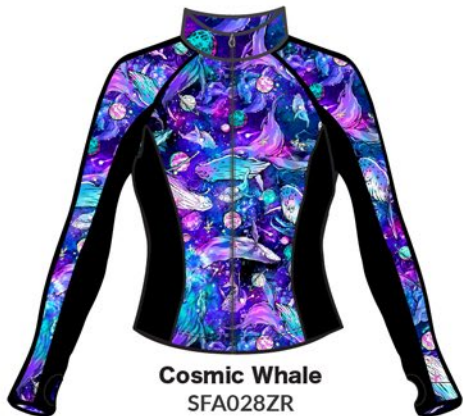
Cosmic Whale SFA028ZR

Helps keep the sleeves in place and provides extra sun protection to the hands