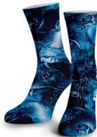
Manta Mayhem SFA005DS