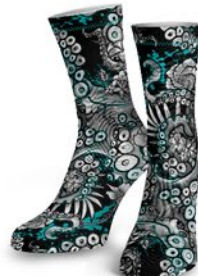
Electric Blue Octofloral SFA014DS