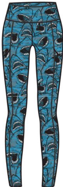
Shark Camo SFA022YP