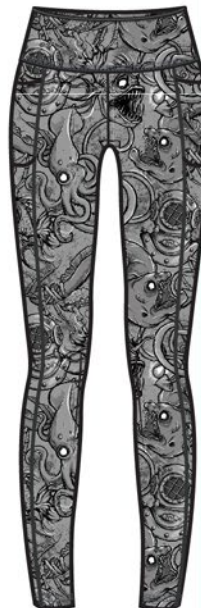
Deep Sea SFA018YP