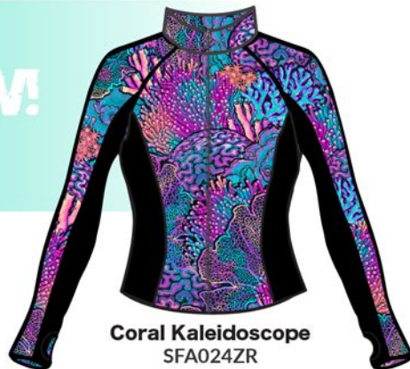
Coral Kaleidoscope SFA024ZR