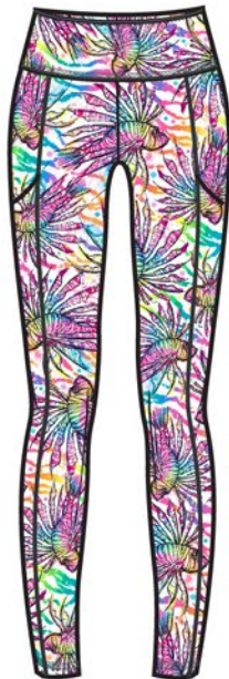
Lionfish Roars SFA019YP

Sublimation Printing Full Sublimated One-of-a-kind Artwork that won't fade or crack