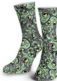
Cookie Octopus SFA027DS