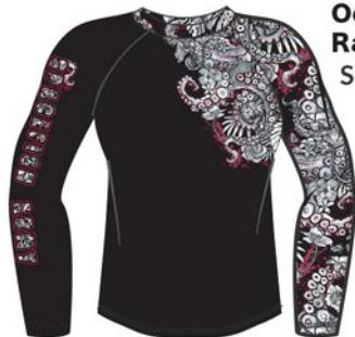
Octopower Rashguard SFA012MR