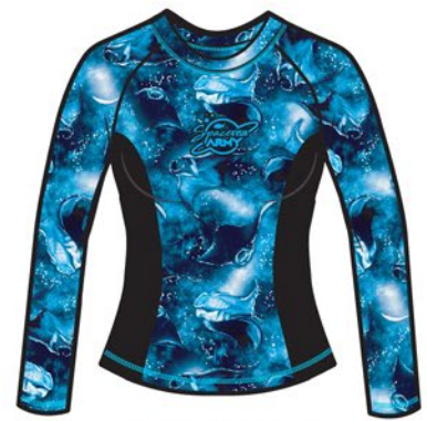
Manta Mayhem SFA005LS