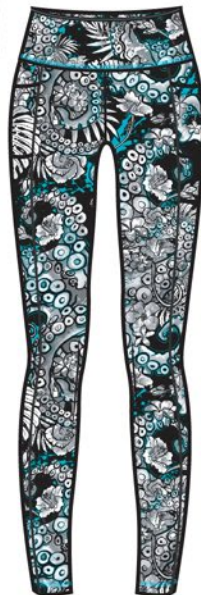
Electric Blue Octofloral SFA014YP