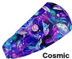
Cosmic Whale SFA028HB