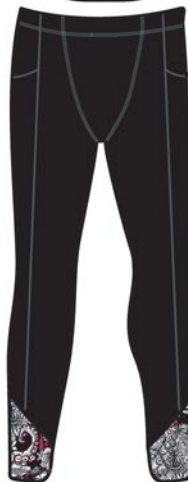
Octopower Scuba Pants SFA012MP