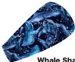
Whale Shark Wonderland SFA016HB