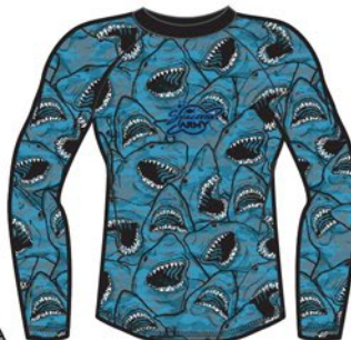
Shark Camo Rashguard SFA022MR