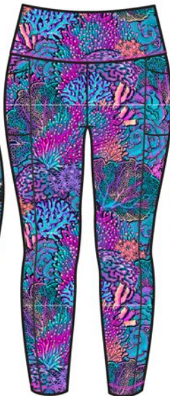
Coral Kaleidoscope SFA024PS