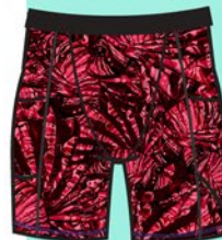
Lionfish Invasion Scuba Shorts SFA031MS