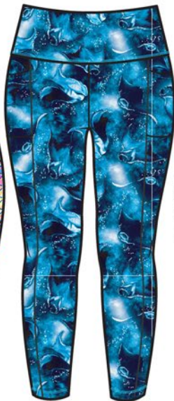
Manta Mayhem SFA005PS