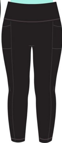
Night Dive SFA034PS