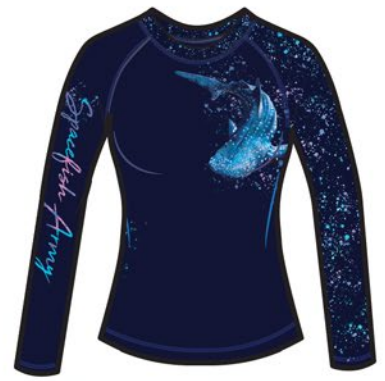
Whale Shark Wonderland SFA016LS