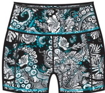
Electric Blue Octofloral