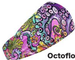
Octofloral Splatterparty SFA001HB