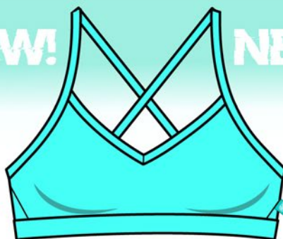
Bahama Blue SKU# SFA030BT