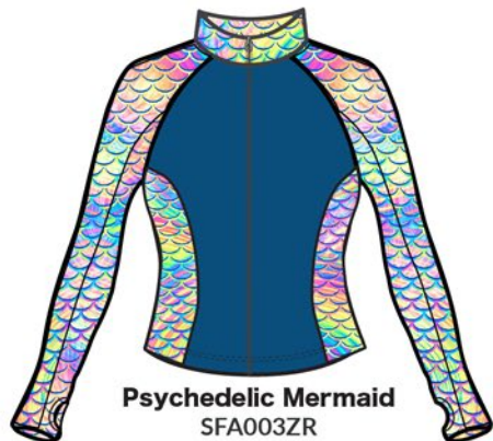
Psychedelic Mermaid SFA003ZR