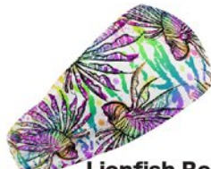
Lionfish Roars SFA019HB