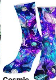
Cosmic Whale SFA028DS