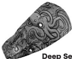
Deep Sea SFA018HB