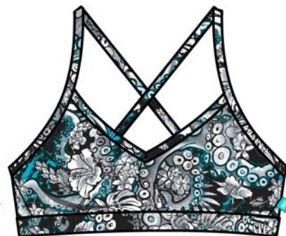
Electric Blue Octofloral SKU# SFA014BT