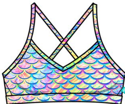
Psychedelic Mermaid SKU# SFA003BT