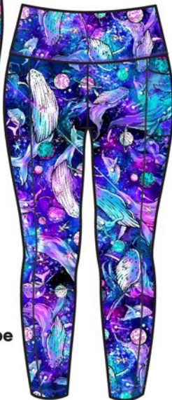
Cosmic Whale SFA028PS