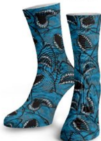
Shark Camo SFA022DS