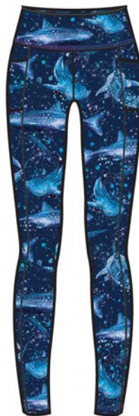
Whale Shark Wonderland SFA016YP