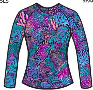
Coral Kaleidoscope SFA024LS