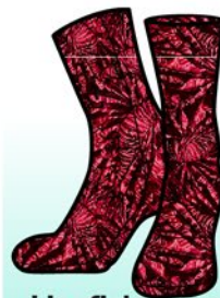
Lionfish Invasion SFA031DS