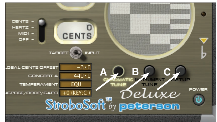
Fig. 4 - Some of StrobeSoft's other functions: A) this button accesses the current default screen; B) this button accesses the screen for special instrument tunings; C) this button accesses the screen for the oscilloscope, spectrum analyzer, pitch graph, noise filter, and more.

For more information about hardware and software tuners from Peterson Electro-Musical Products please visit: www.petersonemp.com