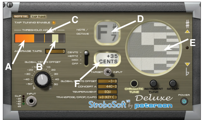
Fig. 3 - StrobeSoft TAP TUNE display screen: A) orange amplitude bar in VU meter; B) white threshold bar; C) peak/hold line indicates the amplitude of the last signal detected by unit; D) the pitch, sharpness or flatness, and octave of the note; E) the tuning wheel; F) the cents window indicating number of cents sharp or flat of the note.