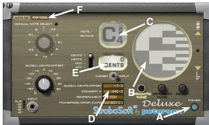
Fig. 1 - StroboSoft default display screen: A ) on-off button; B ) strobe window (when image moves up, the note is sharp; when image moves down, the note is flat); C ) the note window (shows whether natural or sharped note as well as the octave – here showing 4th octave C#; D ) the preset for concert pitch (here showing 440Hz); E ) how many cents sharp or flat the note is; F ) the on-off button to turn on the tap tuning mode.

3) In The Art of Tap Tuning you learned that a compressor can be used to sustain the signal and have it appear for a longer period of time in the window of mechanical strobetuners. Rather than using a compressor to expand the signal, StroboSoft utilizes a very clever averaging function (Fig.2 G). Setting the number here determines how many taps StroboSoft listens to before it averages the frequencies and then provide one response. So, in the case of the