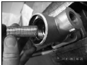
Inspect and clean strainer.