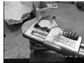
Remove strainer cap.