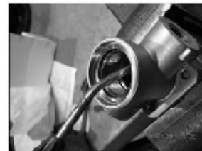
Blow any debris from body.

Reassemble after cleaning and inspecting all parts. Replace gaskets as necessary. Run a soap bubble test with low pressure air to confirm all seals are good before reinstalling in service.