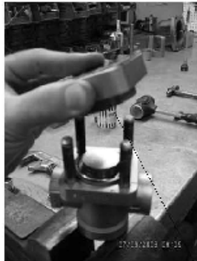
Remove cover nuts & cover.