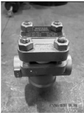
Remove trap from line.