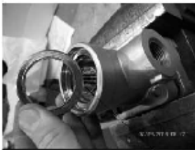
Inspect strainer cap gasket.