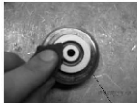
Clean seat with soft rag.