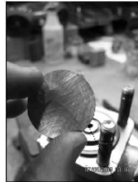
Inspect & clean disc.