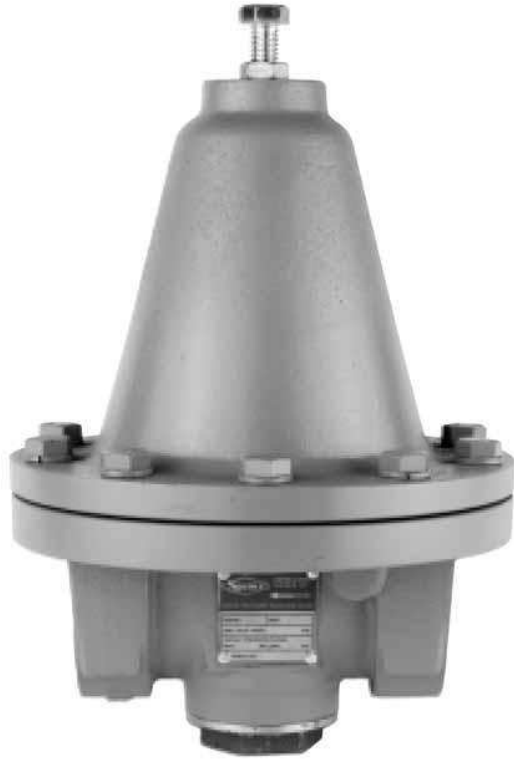
TYPE D50 DIRECT ACTING PRESSURE REDUCING VALVE