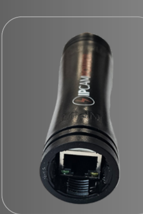
End with Grommet Screwed ON