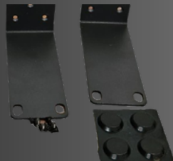
RACK EARS &amp; RUBBER FEET