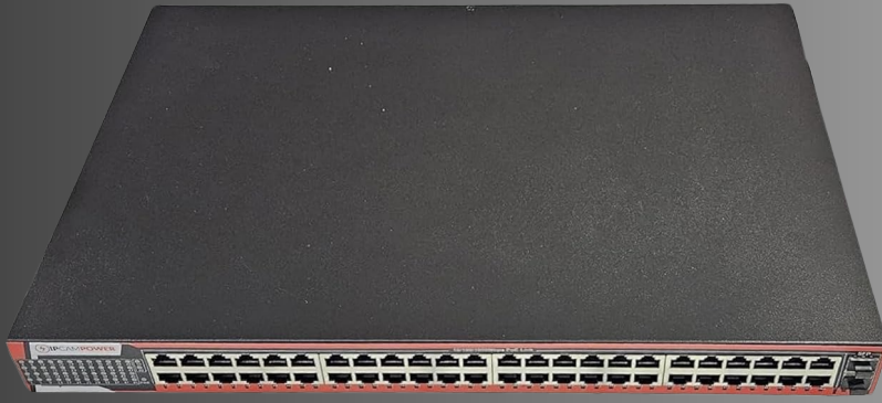
FRONT SIDE (POE SWITCH)