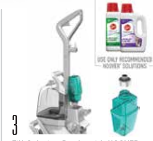
Fill Solution Bottle with HOOVER Solution and slide into back of the unit.