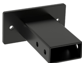
2 Wall Mounts