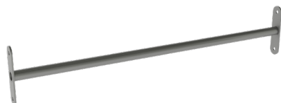
6 Wall Bars