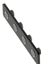
4 Joining Plate Inserts