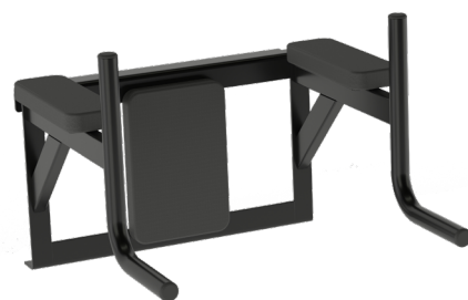
1 Captains Chair