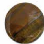
TIGERS EYE (TIG)