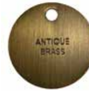
ANTIQUE BRASS (AB)

Hand polished brass finished with darker oxidized patina added for highlights and an aged feel. This is a living finish.