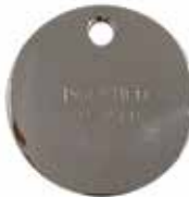
POLISHED NICKEL (PN)

Hand polished brass, with burnished finish and a light dusting of verdigris applied to recess areas. This is a living finish.