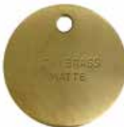
SATIN BRASS MATTE (SBM)

Hand polished brass, lightly distressed and brushed to add a vintage feel. This has a lacquered finish.