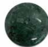
GREEN JADE (GRJ)