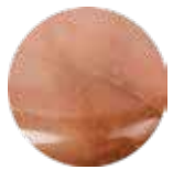
PEACH AVENTURINE (PEA)