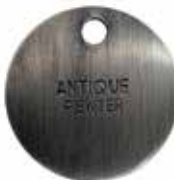
ANTIQUE PEWTER (AP)

Hand polished brass, wire brushed for a soft satin gold finish. This has a lacquered finish.