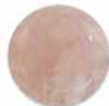
ROSE QUARTZ (ROS)