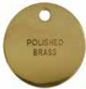
POLISHED BRASS (PB)

Our finish swatches are a great tool to help you make your final hardware selection. All swatches are made of solid brass, showcasing each of our hand applied finishes. Due to the nature of our hand finishing process, some products such as those with a hand-applied patina will have lot-to-lot variations as to color and/or finish.