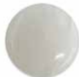
WHITE QUARTZ (WTQ)