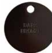
DARK BRONZE (DB)

Solid brass hand distressed and lightly brushed to add a slightly aged feel. This has a lacquered finish.