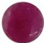
PINK JADE (PIN)