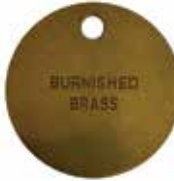
BURNISHED BRASS (BB)

Solid brass, expertly polished to a high sheen. This has a lacquered finish.