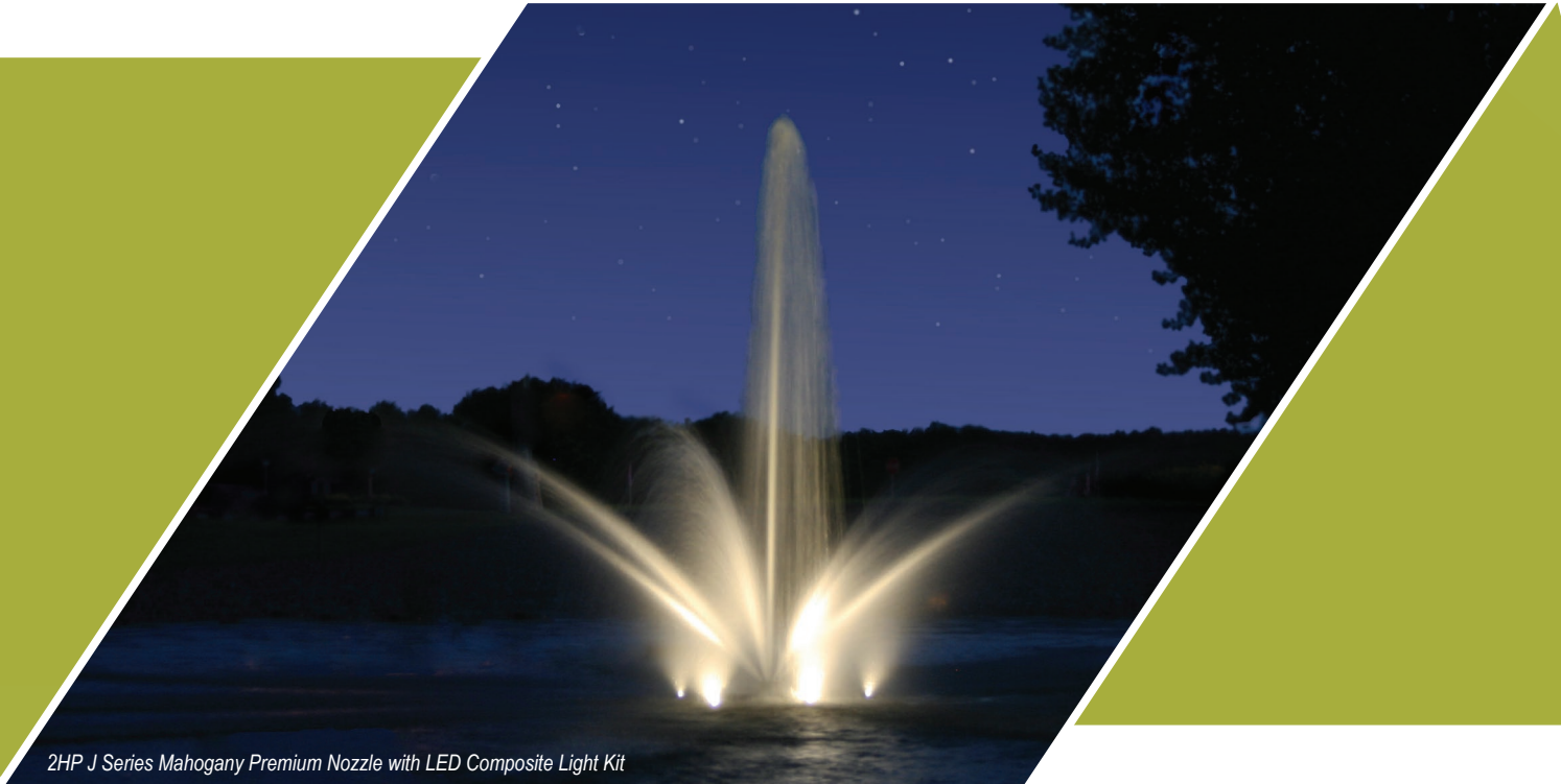
2HP J Series Mahogany Premium Nozzle with LED Composite Light Kit