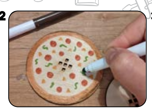
Decorate the top of the large piece with markers. You can make it anything you want!