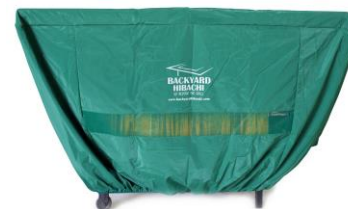
Backyard Hibachi Accessory Bundle Kit