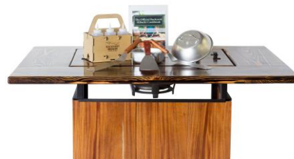
Backyard Hibachi Accessory Bundle Kit