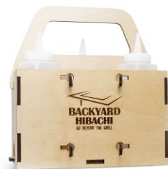
6 Pack Bottle Carrier