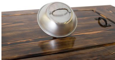
3 Pack Squeeze Bottles