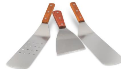
Backyard Hibachi Cooking Utensils