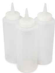
3 Pack Squeeze Bottles

In addition to our grills, we also offer a number of grill accessories. Check out our top selling bundle kit as well as our cookbook to see how to make the most of your Backyard Hibachi Grill. You can also use any of your existing grilling favorites, like BBQ tools sets and skewers for grilling, if you'd prefer!