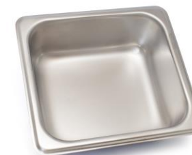
Backyard Hibachi Cooking Utensils