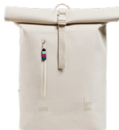
● SOFT SHELL