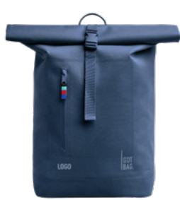
● OCEAN BLUE