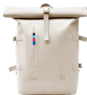
● SOFT SHELL