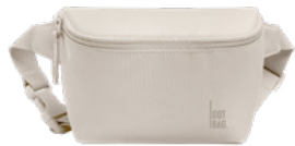
● SOFT SHELL