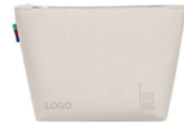
● SOFT SHELL