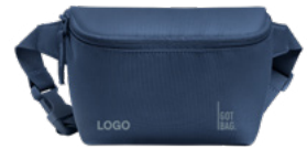
● OCEAN BLUE