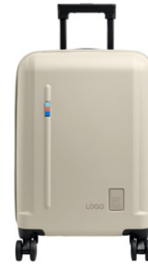
● SOFT SHELL