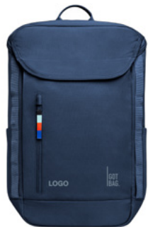
● OCEAN BLUE