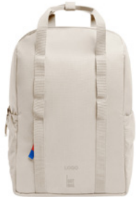
● SOFT SHELL