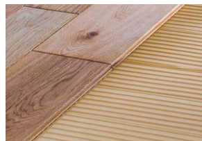
Picture 2. Plank bonding.