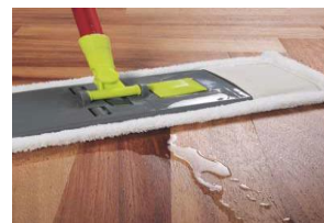
Picture 3. Clean spills promptly.

Your new Prestige Oak Floor is a living material that will expand and contract in shape if moisture or humidity is raised. It may also shrink if moisture or humidity becomes very low. As a natural product damage from these circumstances may lead to irreversible deformation of the floor if the room climate and humidity is left too high or too low for an extended period of time. In winter months for example if the humidity (RH) in a heated room goes below the specified 45 % the floor may be subjected to conditions that may result in plank changes. In this case you should install an air humidifier to prevent damages to your floor. The same may also be necessary with air conditioned rooms.