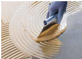
Picture 1. Trowel spread