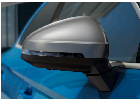
Exterior mirror housings in aluminium look