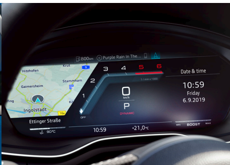
Audi virtual cockpit plus