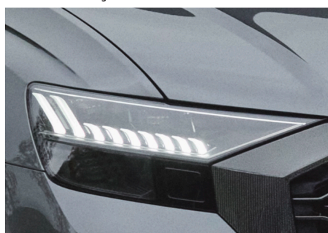
HD Matrix LED headlights