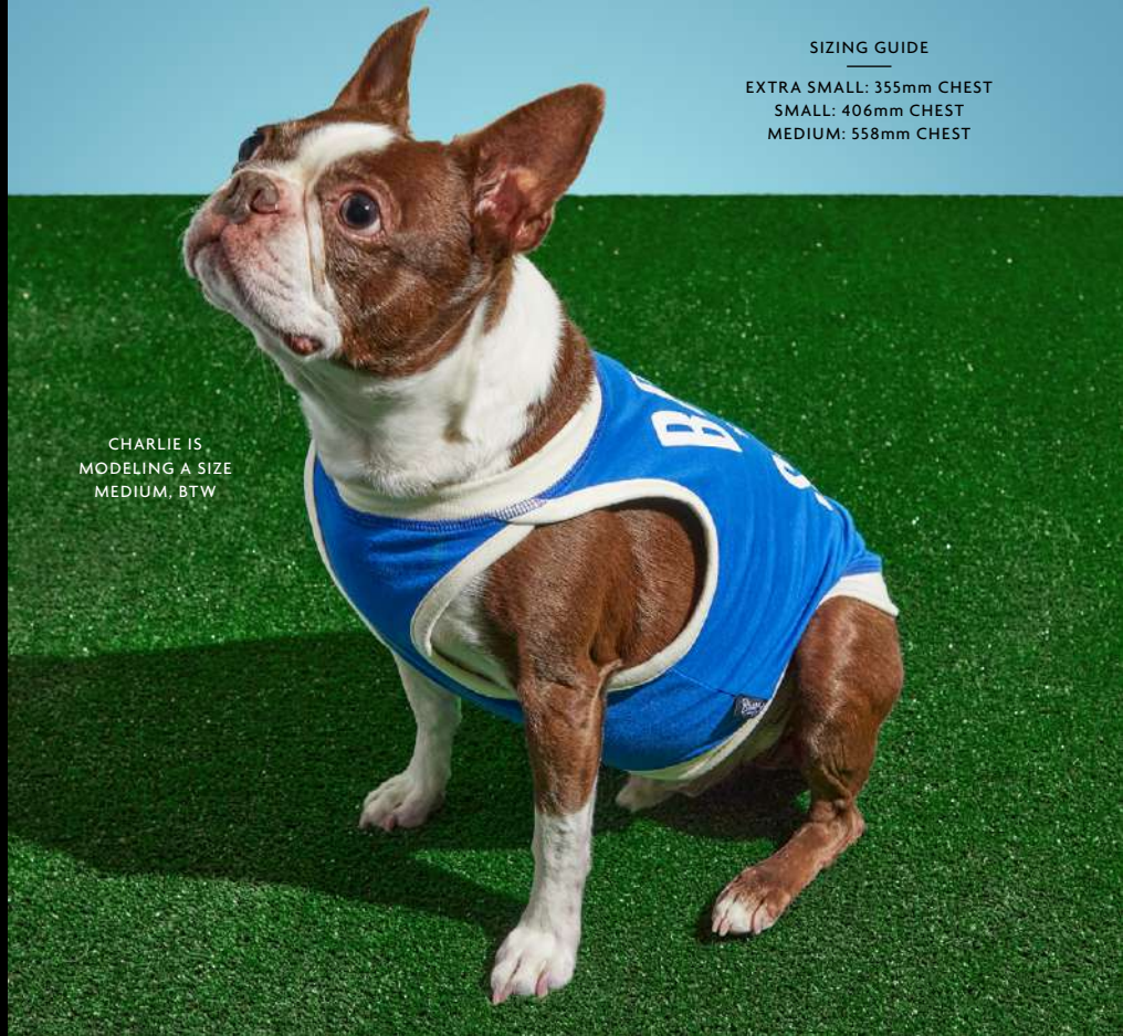
CHARLIE IS MODELING A SIZE MEDIUM, BTW

EXTRA SMALL: 355mm CHEST SMALL: 406mm CHEST MEDIUM: 558mm CHEST