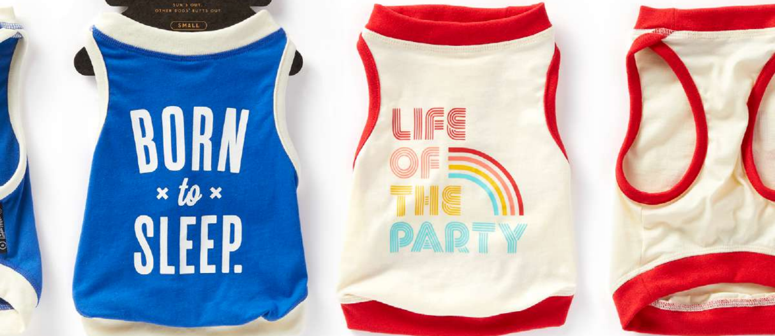
TOP OF TANK