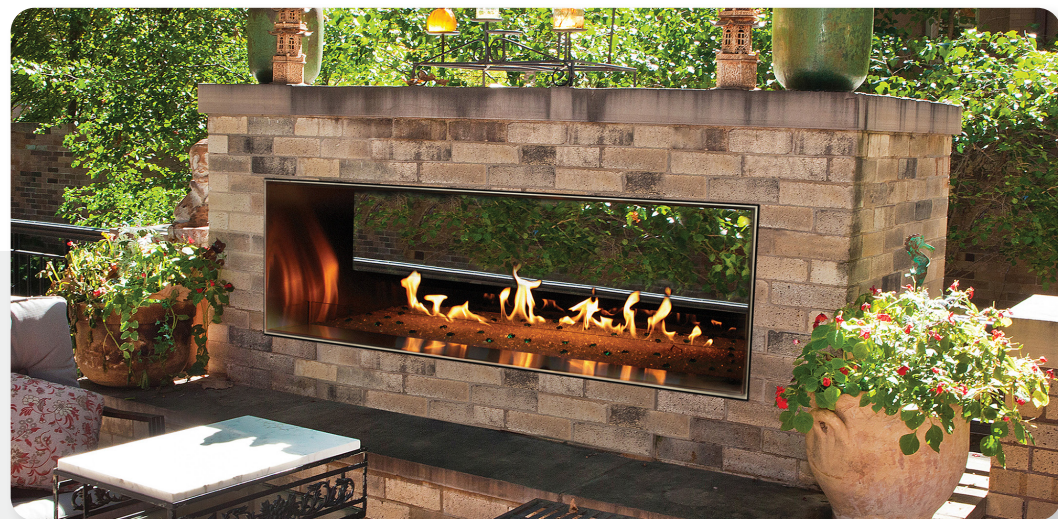
Carol Rose Coastal Collection – 48-inch Outdoor Stainless Steel Linear See-Through Fireplace

Whether you're looking to purchase one gas product or 100, turn to F.W. Webb as your local resource.