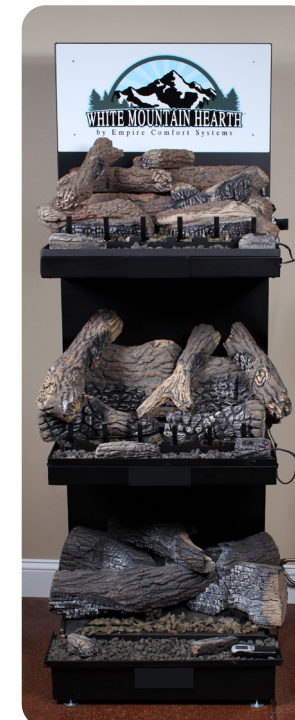
Point of Purchase Display available