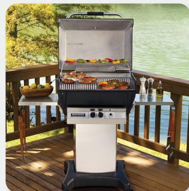
Super Premium Series Propane Grill