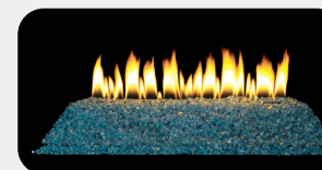
Loft burner available in various color options