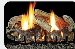
Stacked Aged Oak