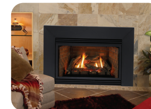
Innsbrook Traditional Series