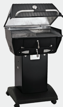
Independent Charcoal Grill