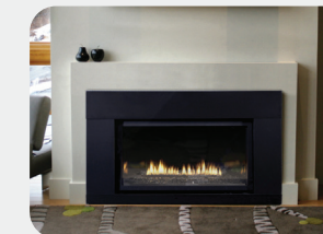
Loft Contemporary Series

Stocking both traditional and linear fireplaces in direct vent and vent free styles. Accessories and venting available to customize installations.